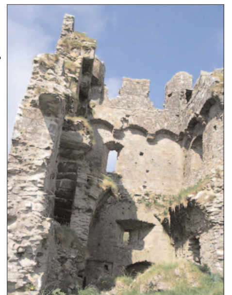
Caisleán Ráthanáin Rahinnane Castle